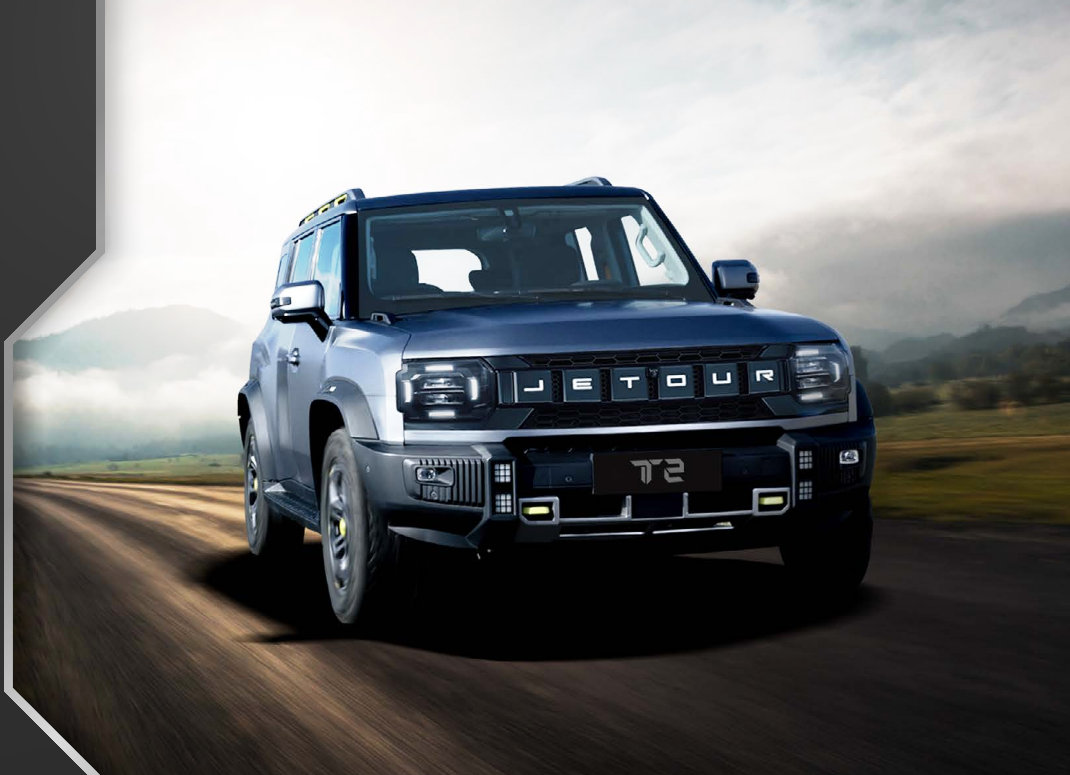
AUTOMATIC BRAKING SYSTEM