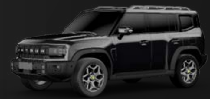
/// NIGHT BLACK