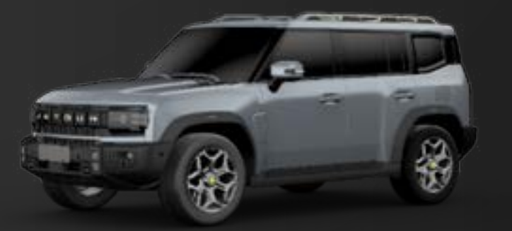
/// MISTY CYAN