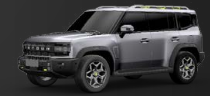
/// HIGHWAY GREY