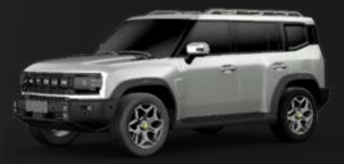
/// SILVER SNOW