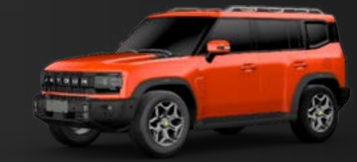
/// SUN ORANGE