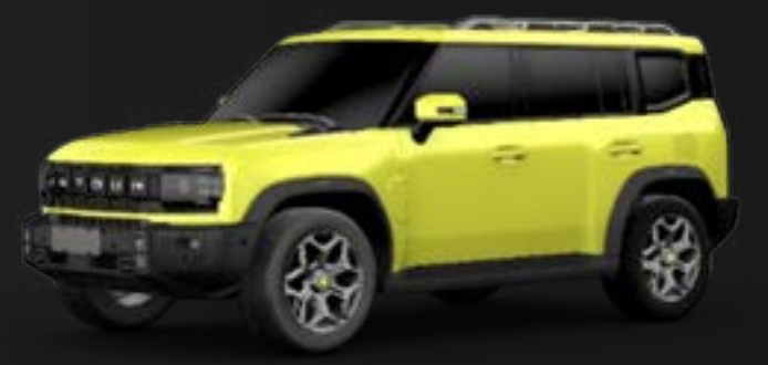
/// LIME GREEN